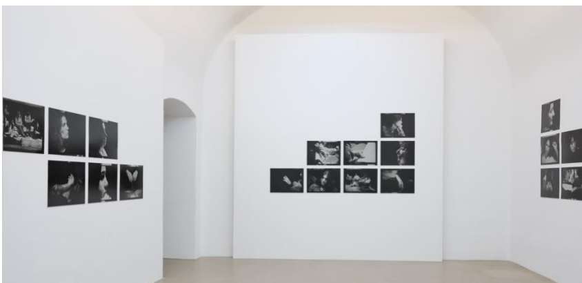
il piacere del testo – remake (2024)

photo series based on the film Il piacere del testo by Adriana Monti (1977)