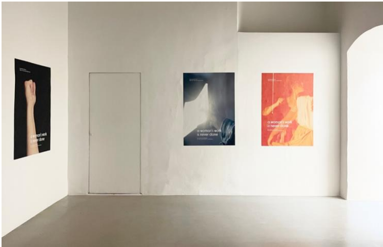
a woman's work is never done – the culture of women for the preservation of humanity (2024)